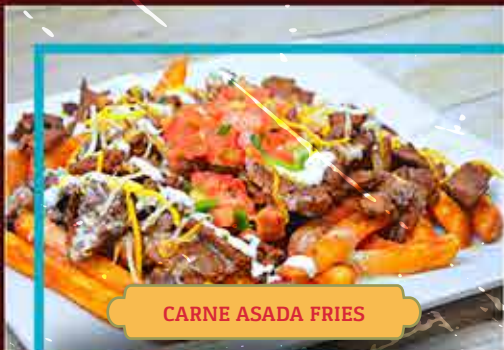
CARNE ASADA FRIES