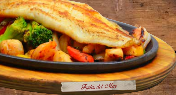
Fajitas del Mar