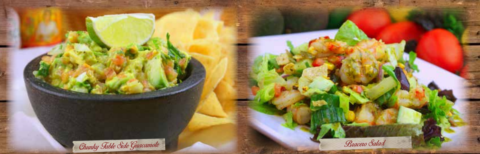
Chunky Table Side Guacamole