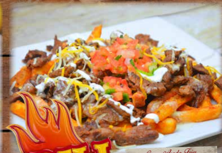
Carne Asada Fries