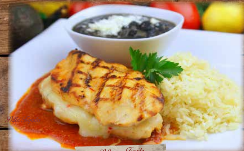
Pollo con Tequila