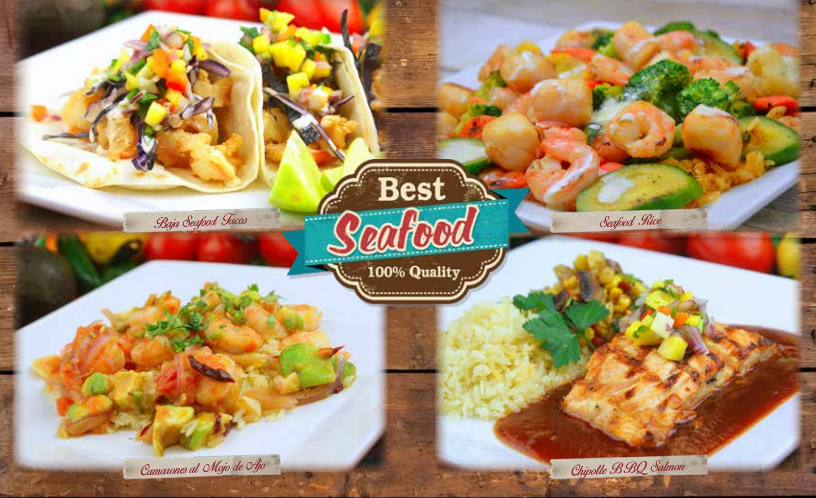
Baja Seafood Tacos