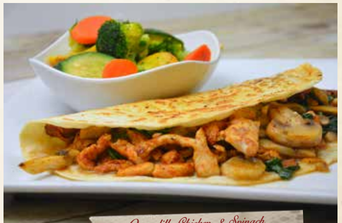
Quesadilla Chicken & Spinach

A hot stone bowl filled with grilled chicken, shrimp and steak, cooked with onions & poblano peppers, topped with your choice of salsa ranchera or salsa verde, smothered with shredded cheese, served with rice, beans and warm flour tortillas 16.99