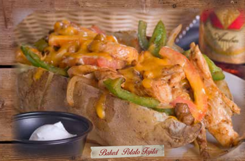
Baked Potato Fajita