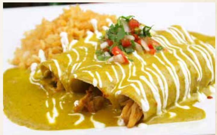
Enchiladas Bang Bang

Three enchiladas stuffed with sauteed spinach, zucchini, squash, mushrooms and roasted corn topped with shredded cheese and roasted poblano salsa, garnished with sour cream 9.99