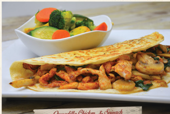
Quesadilla Chicken & Spinach

A cheese quesadilla stuffed with sautéed mushrooms, zucchini and squash smothered with cheese sauce. Served with rice 13.99