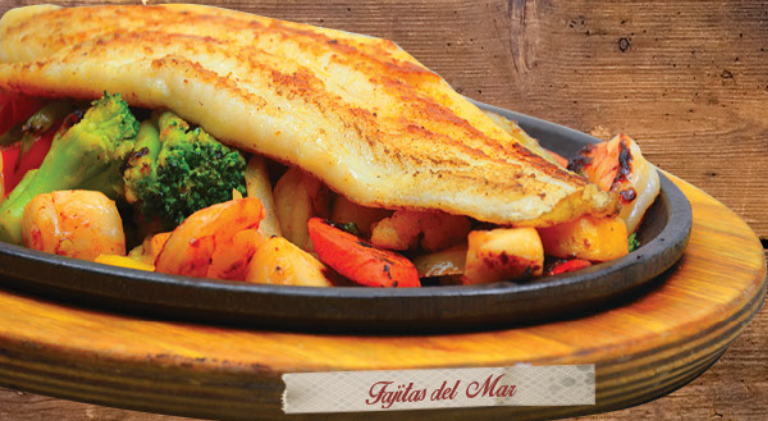
Fajitas del Mar