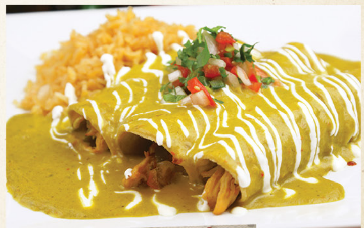
Enchiladas Bang Bang

*NOTICE: COOKED TO ORDER CONSUMING RAW OR UNDERCOOKED MEATS, POULTRY, SEAFOOD, SHELLFISH OR EGGS MAY INCREASE YOUR RISK OF FOOD BORNE ILLNESS, ESPECIALLY IF YOU HAVE CERTAIN MEDICAL CONDITIONS