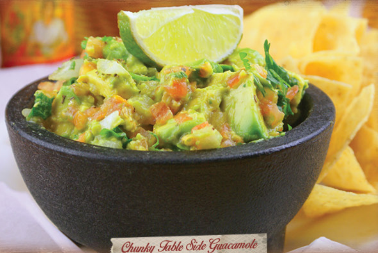
Chunky Table Side Guacamole