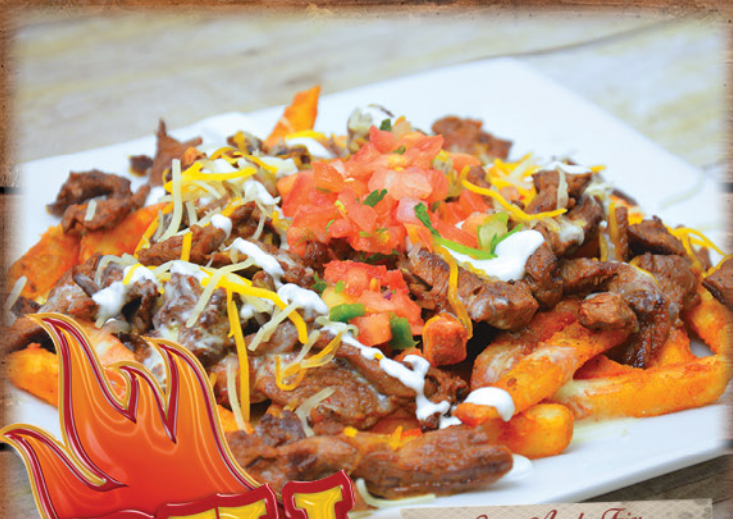
Carne Asada Fries