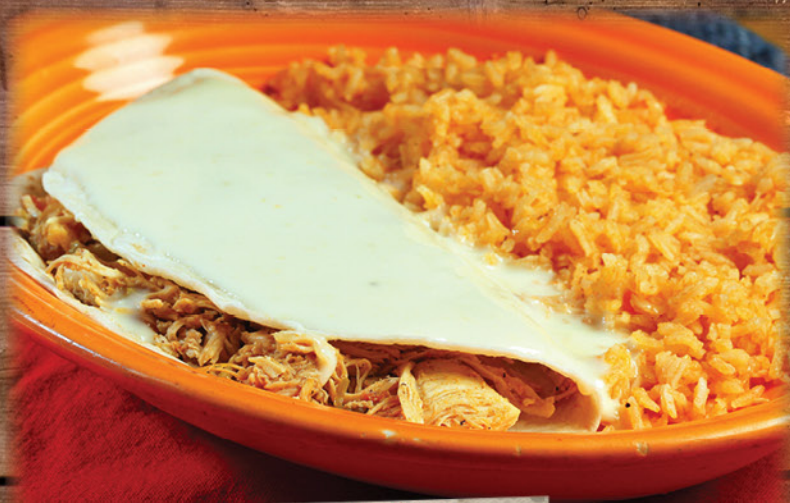
Lunch # 5