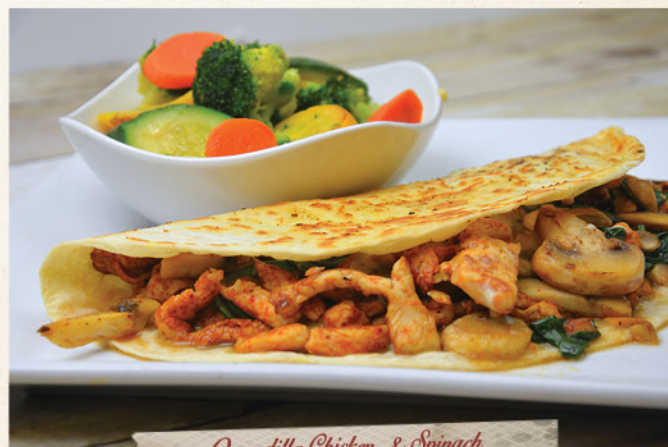
Quesadilla Chicken & Spinach

A hot stone bowl filled with grilled chicken, shrimp and steak, cooked with onions & poblano peppers, topped with your choice of salsa ranchera or salsa verde, smothered with shredded cheese, served with rice, beans and warm flour tortillas 18.99