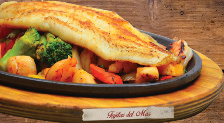
Fajitas del Mar