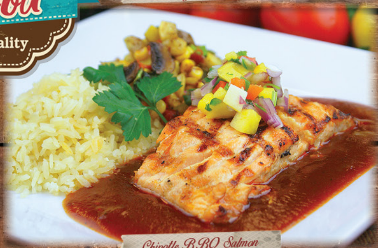
Chipotle BBQ Salmon