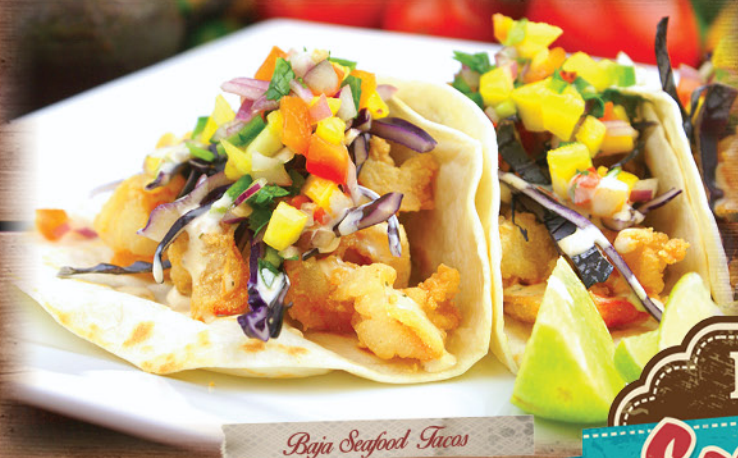
Baja Seafood Tacos