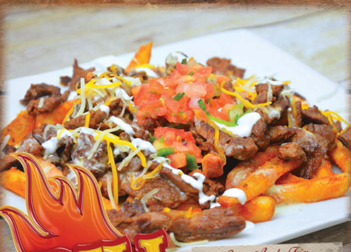
Carne Asada Fries