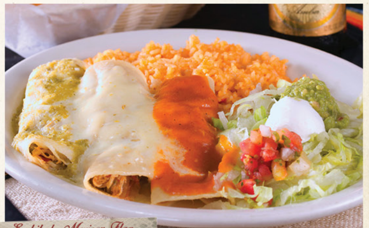
Enchiladas Mexican Flag