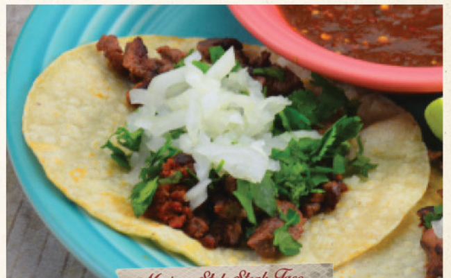
Mexican Style Steak Taco