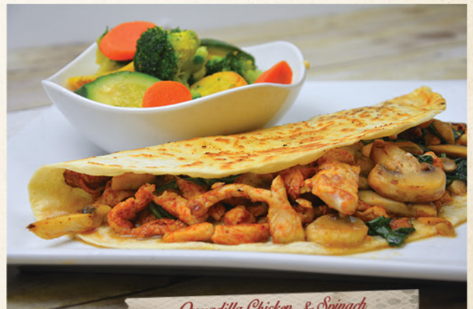
Quesadilla Chicken & Spinach

A hot stone bowl filled with grilled chicken, shrimp and steak, cooked with onions & poblano peppers, topped with your choice of salsa verde, salsa ranchera or salsa bang bang, smothered with cheese sauce, served with rice, beans and warm flour tortillas $21.99