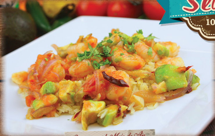
Camarones al Mojo de Ajo