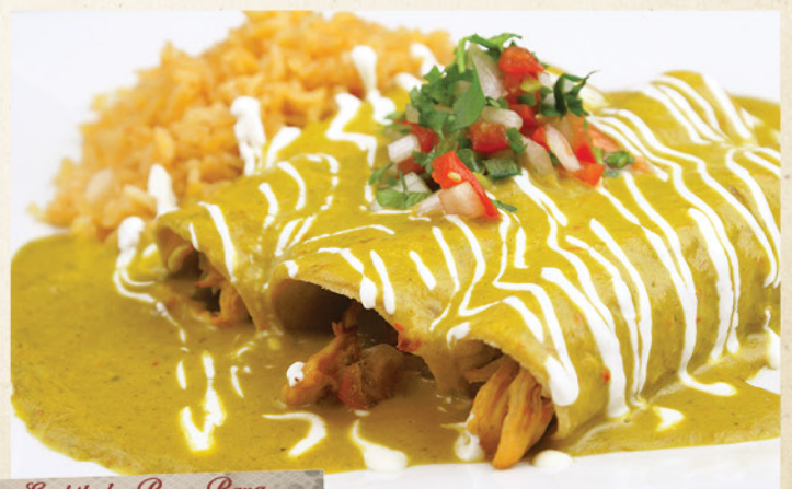
Enchiladas Bang Bang

*NOTICE: COOKED TO ORDER CONSUMING RAW OR UNDERCOOKED MEATS, POULTRY, SEAFOOD, SHELLFISH OR EGGS MAY INCREASE YOUR RISK OF FOOD BORNE ILLNESS, ESPECIALLY IF YOU HAVE CERTAIN MEDICAL CONDITIONS