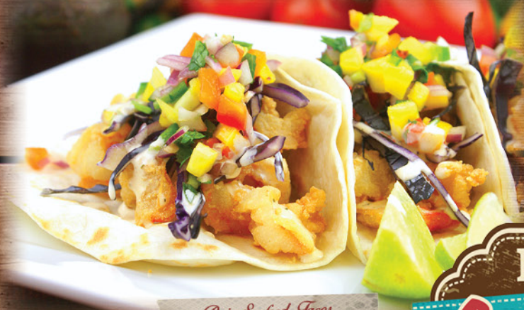
Baja Seafood Tacos