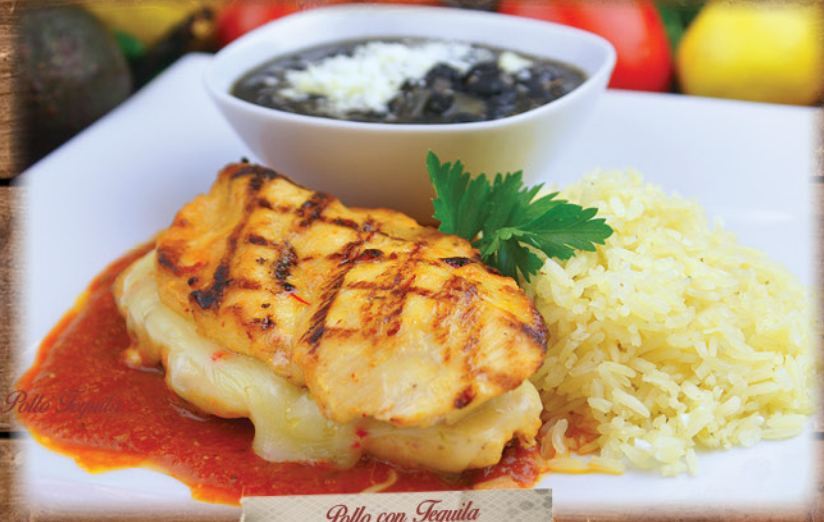
Pollo con Tequila