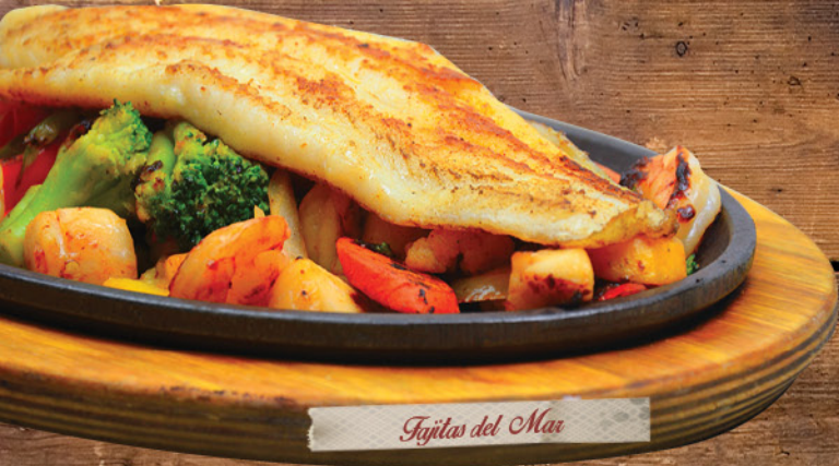
Fajitas del Mar