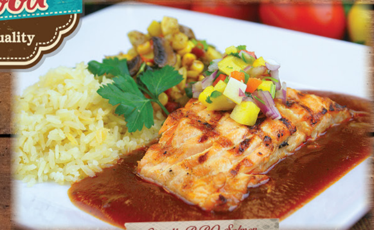
Chipotle BBQ Salmon