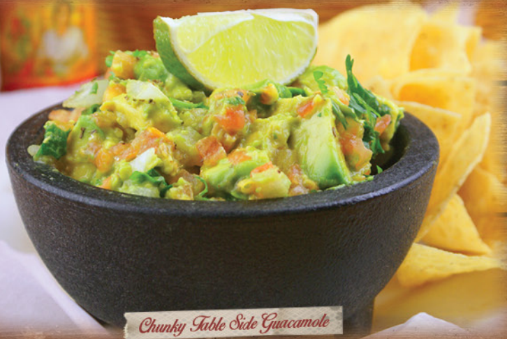
Chunky Table Side Guacamole