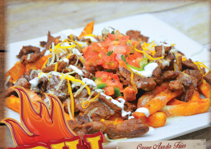
Carne Asada Fries