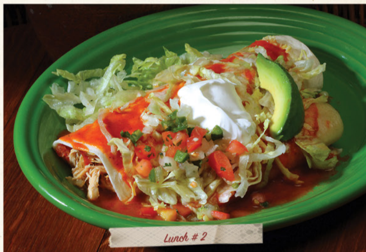
Lunch # 2

One grilled fish filet, 4 grilled shrimp, served with white rice and mixed veggies. 11.99