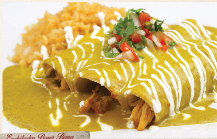
Enchiladas Bang Bang