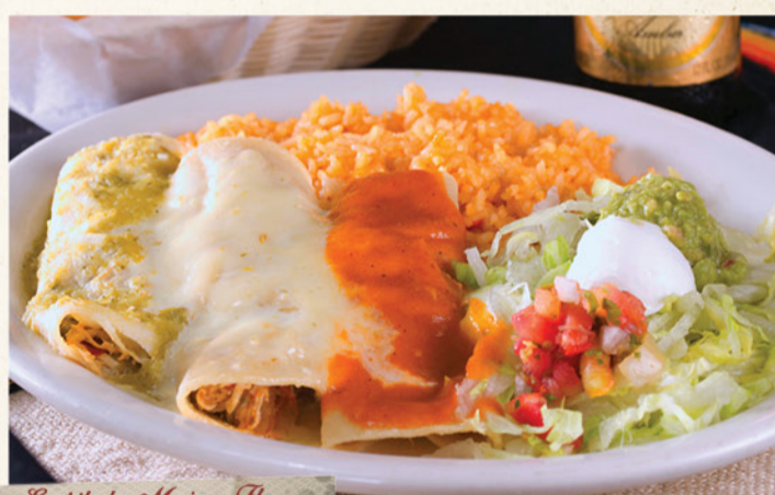
Enchiladas Mexican Flag