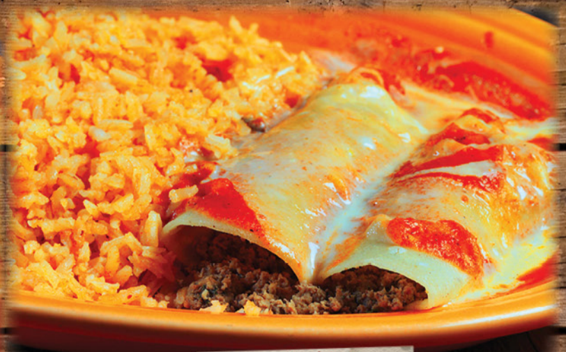
Lunch # 6