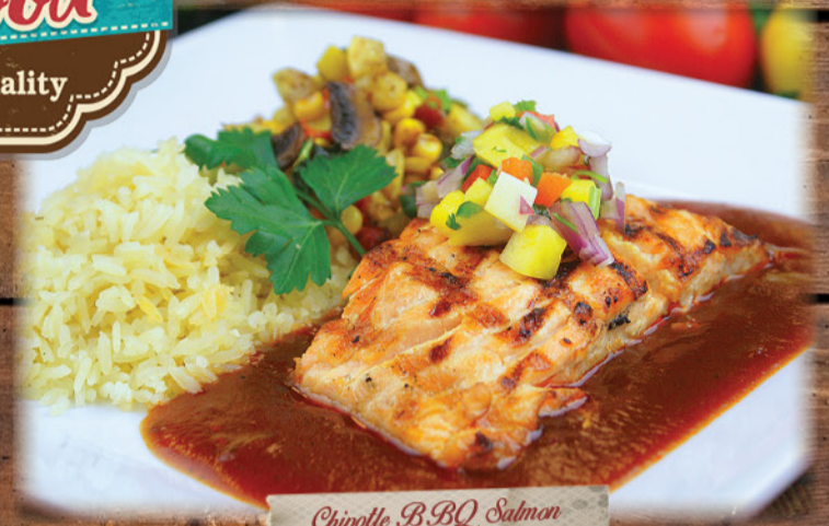
Chipotle BBQ Salmon