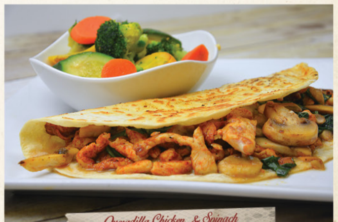
Quesadilla Chicken & Spinach