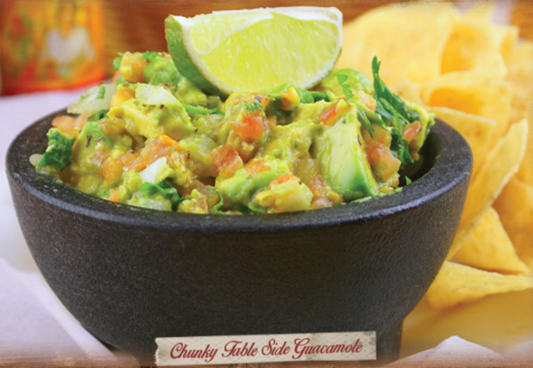
Chunky Table Side Guacamole