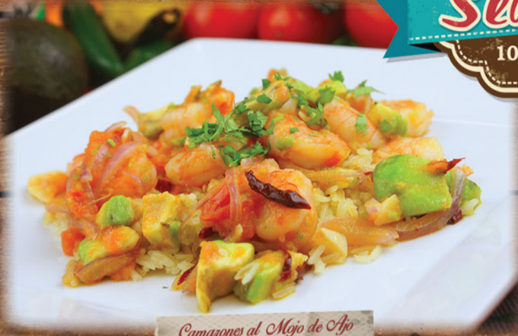
Camarones al Mojo de Ajo