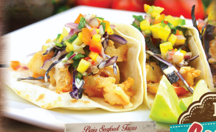
Baja Seafood Tacos