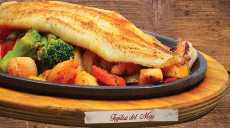
Fajitas del Mar