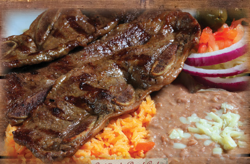
Costillas de Res al Carbon