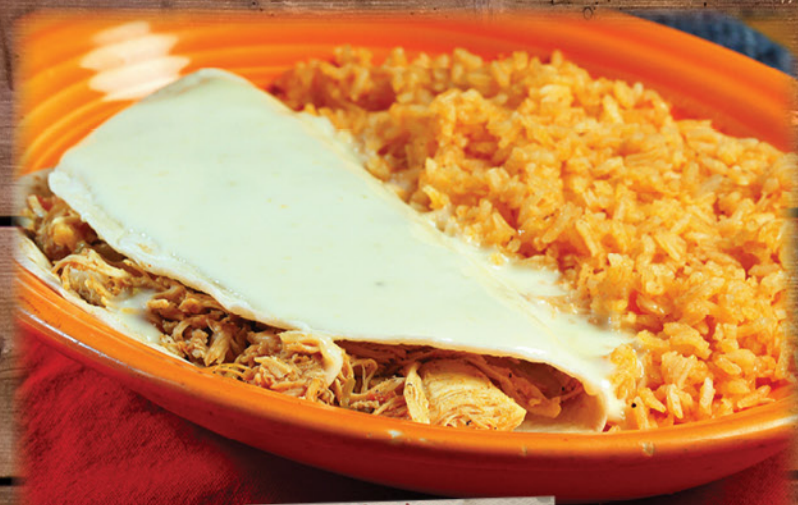
Lunch # 5