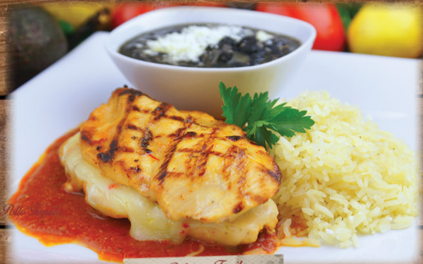
Pollo con Tequila