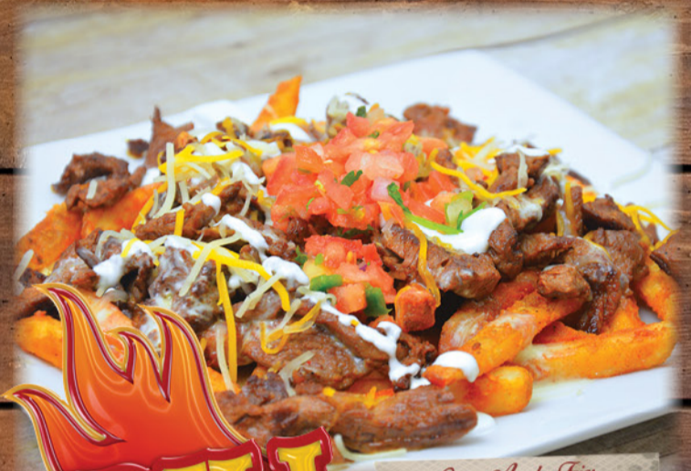
Carne Asada Fries